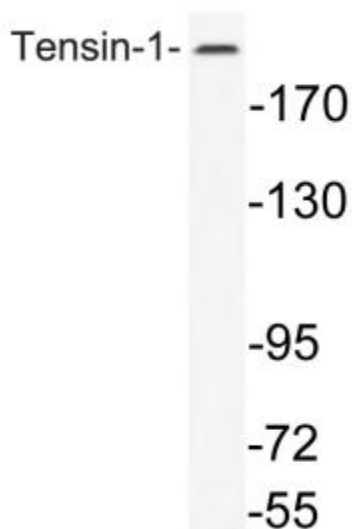
Western blot analysis of lysate from K562 cells, using Tensin-1 antibody.