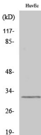
Western Blot analysis of various cells using DIO3 Polyclonal Antibody

This product can be used in immunological reaction related experiments. For more information, please consult technical personnel.