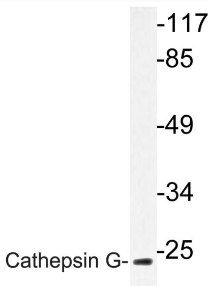
Western blot analysis of lysate from COLO cells, using Cathepsin G antibody.